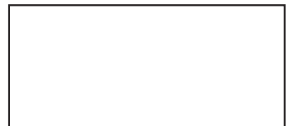
Clinic Stamp, if given at a clinic

We certify that the above information is accurate and complete: