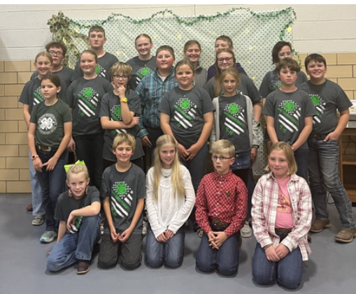
Project Record Award Winners

Congratulations to all 4-Her's who received their achievement pins and project awards. We are so proud of you for the hard work you have put in this last year.