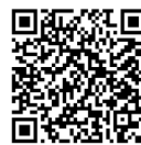
ZBooks Online 4-H Record Keeping

ZBooks online 4-H Record Keeping and Resources. The Permanent Record is included in ZBooks. This is a great way to keep your records as you go all year long, so you don't wait until the last minute and forget something.