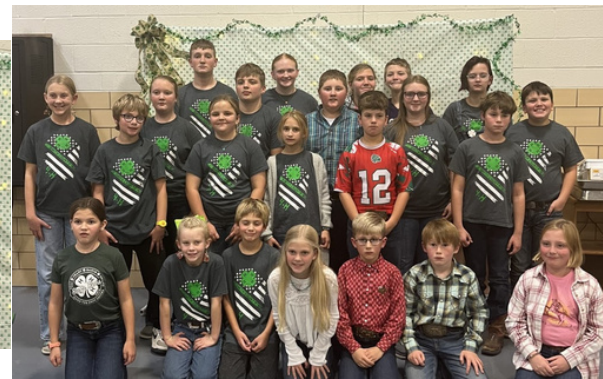
Achievement Pin Award Winners