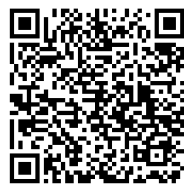
Schedule and information for 4-H judging and events.