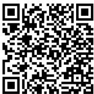
Kansas 4-H State Fair Website

The Grand Drive is September 5-8. Highlights will be shared throughout the fair on the Facebook page for "The Grand Drive". This is a great way to support the Post Rock District 4-H youth showing their livestock, if you can't be there in person.