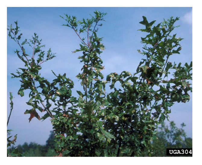
Image 3. Young oak tree (Prunus spp.) showing damage from nearby use of the herbicide triclopyr (WSSA #4).

Quinclorac is an auxin-mimic herbicide (WSSA Group #4) used for selective control of broadleaf and grassy weeds . It is absorbed via both foliage and roots and translocated throughout the plant. Symptoms following treatment vary among broadleaf and grass weeds susceptible to quinclorac. Acute toxicity of quinclorac is considered fairly low ( LD_{50} > 2610 \text{ mg/kg} ) and volatility risks are negligible. Quinclorac can persist in soil for