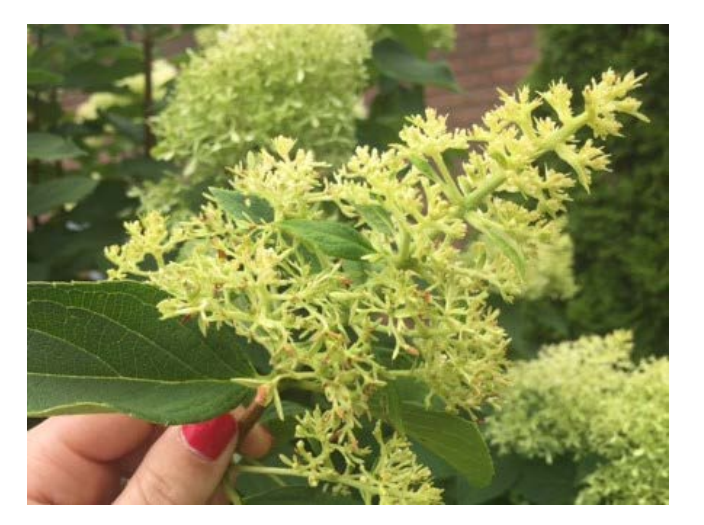
Image 4. Damage to Hydrangea paniculata bloom showing distorted flower formation from use of Roundup<sup>®</sup> Extended Control (glyphosate + imazapic + diquat) as an edge treatment for weed control in the landscape bed when the homeowner had thought they selected a glyphosate-only Roundup<sup>®</sup> product.

Pelargonic acid is a non-selective herbicide used for broad-spectrum control of green vegetation including broadleaf and grassy weeds, as well as mosses. Pelargonic acid is a contact herbicide . It does not translocate and only burns treated tissue via an unknown mechanism (WSSA Group #0). Acute toxicity of pelargonic acid is low ( LD_{50} > 5000 \text{ mg/kg} ); however, it can be volatilized after application. Pelargonic acid is not persistent in soil .