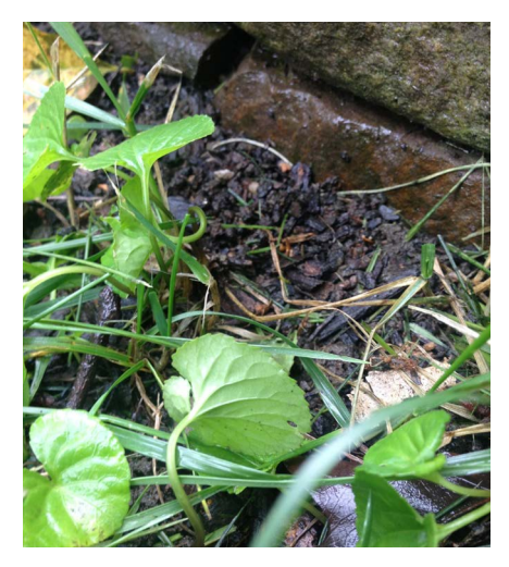
Image 2. Epinastic growth of wild violet (Viola spp.) following application of an auxin-mimic herbicide (WSSA Group #4).

Volatility risk with triclopyr is considered low and acute toxicity is intermediate (LD_{50} = 713 \text{ mg/kg}) . Triclopyr is not readily adsorbed to soil and can persist for upwards of 46 days depending on soil characteristics, which limits planting thereafter. For example, label directions for triclopyr (Turflon Ester Ultra. Corteva AgriSciences. Zionsville, IN) require turfgrass establishment from seed to be delayed at least 14 days after application. Triclopyr is a Group #4 herbicide and applications pose risks to desirable flowering plants in landscapes. See Image 3.